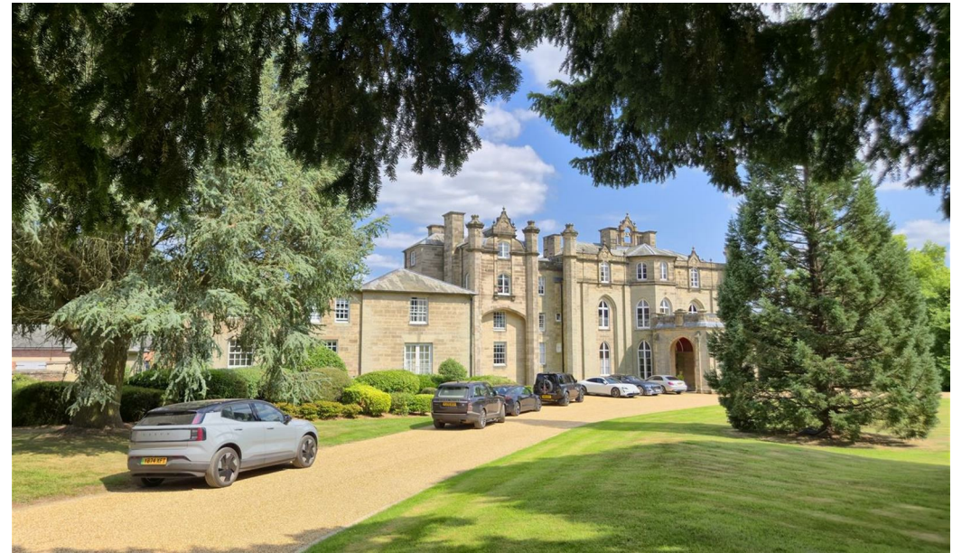
The Ashby, Apartment 2, Coleorton Hall Constable Way, Coleorton, Leicestershire, LE67 8FZ