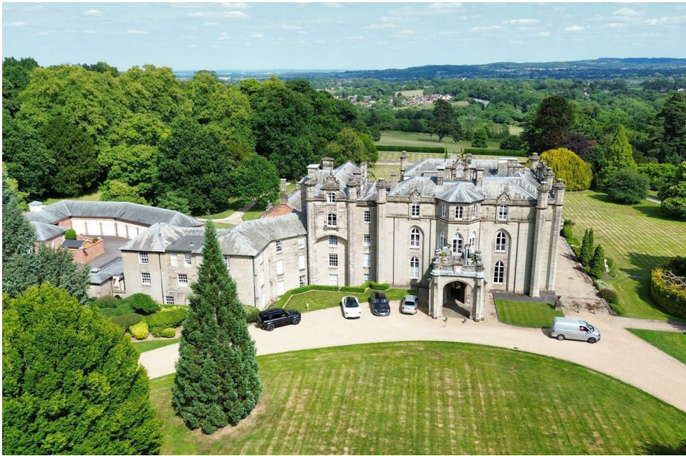
The Ashby, Apartment 2, Coleorton Hall Constable Way, Coleorton, Leicestershire, LE67 8FZ