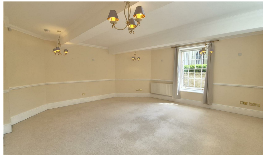
The Ashby, Apartment 2, Coleorton Hall Constable Way, Coleorton, Leicestershire, LE67 8FZ