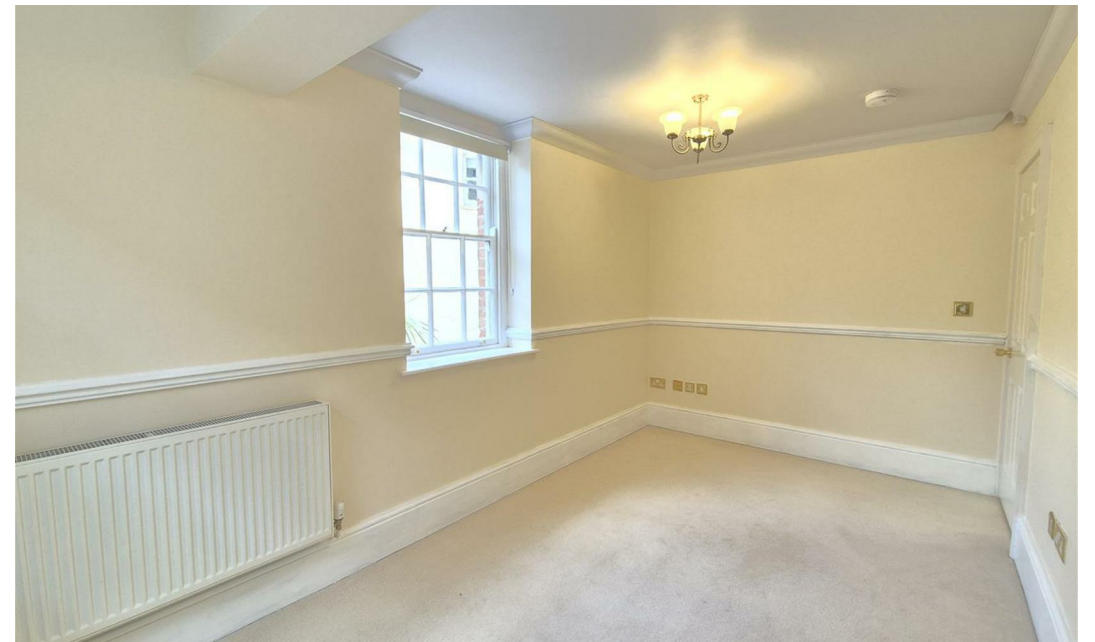
The Ashby, Apartment 2, Coleorton Hall Constable Way, Coleorton, Leicestershire, LE67 8FZ